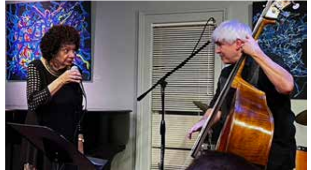
TOP: Jason Kao Hwang's Burning Bridge at Bethlehem Church